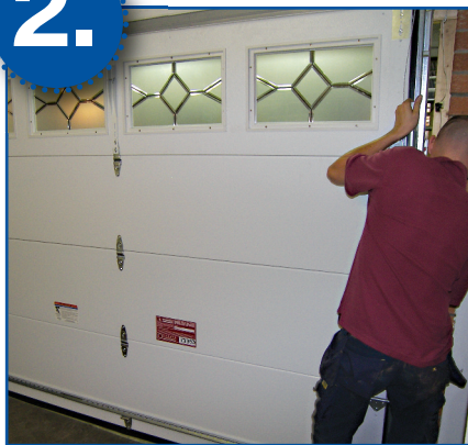
Lift into opening, level, fit top corner fasteners and lock top section.