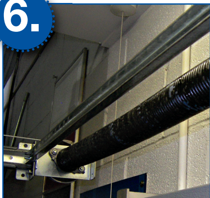
Attach pre-set torsion assembly, spacer bar and wind spring.