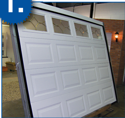
Factory-assembled, ready for fitting.