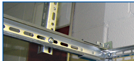
Back hang from wall or ceiling.