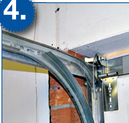
Click in radius, slide horizontal forward to vertical track, fix radius.