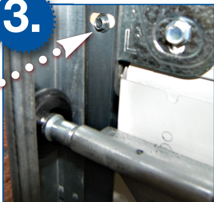
Fix vertical fasteners through access holes.