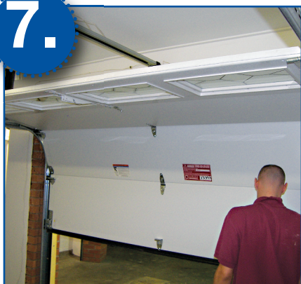
Check balance, door installed.